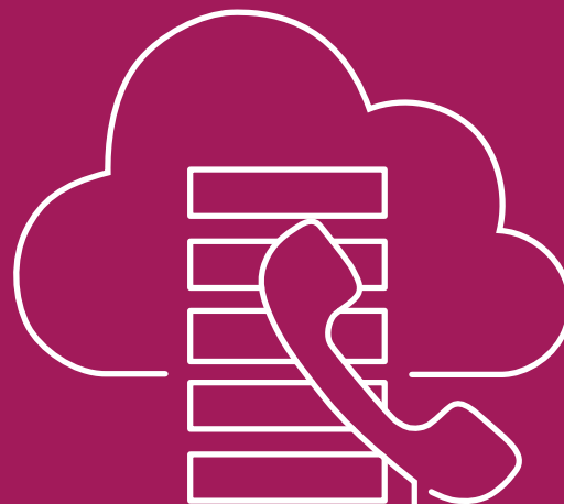
Decline of ISDN vs Rise of SIPT

Session Initiation Protocol (SIP) is a very cost-effective way of providing voice, video and unified communications. More and more incumbent providers are phasing out ISDN and this will force users to migrate to an alternative over the next few years. Indeed, BT has announced* that it will close the ISDN network by 2025. SIP Trunking provides the perfect solution to fill the gap between legacy systems and the world of IP and cloud-based solutions. It allows users to make simultaneous calls over the Internet or a dedicated IP network and has already become the new standard for voice communications.